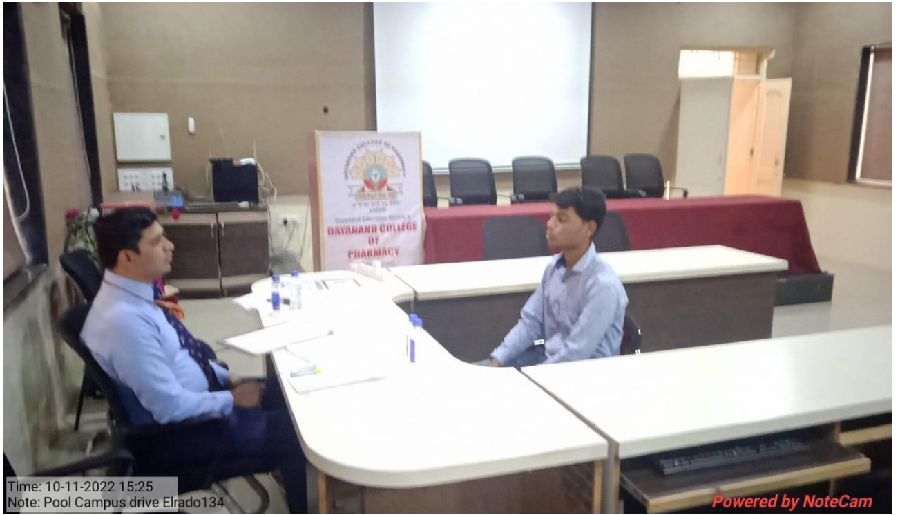
HR Manager taking the interview of Candidate in Seminar Hall of DCOP Latur.