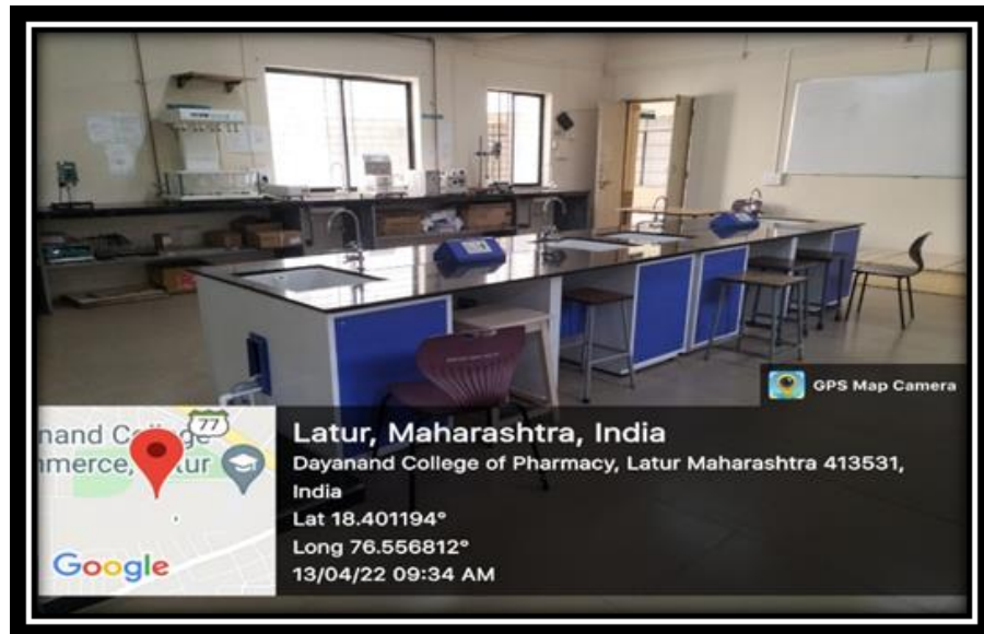
Pharmaceutics Lab 1 (M – Pharmacy) (Internal)