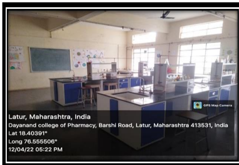
Pharma Chemistry Lab 4 (Internal)