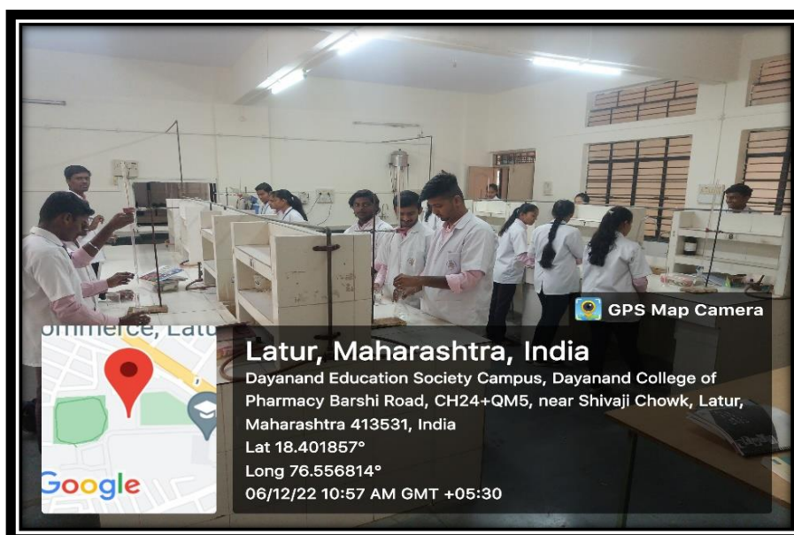
Chemistry Lab 2 (Internal)