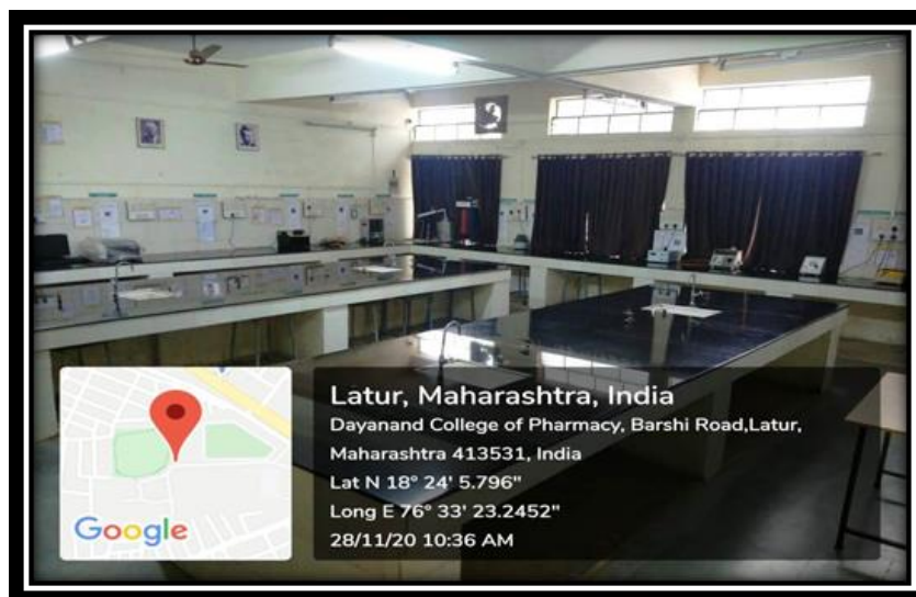
Central Instrumentation room (Internal)