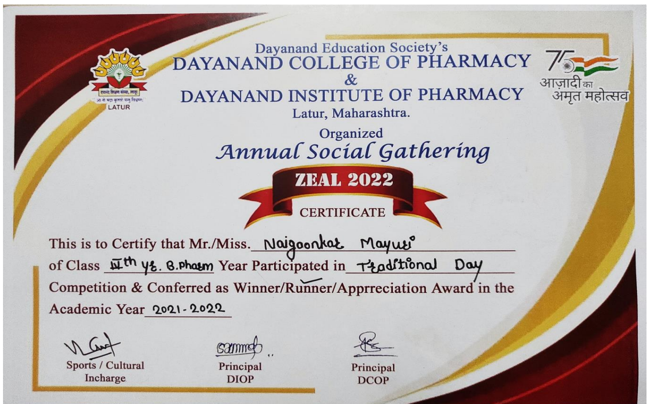
Certificate of Annual Social Gathering ZEAL-2022