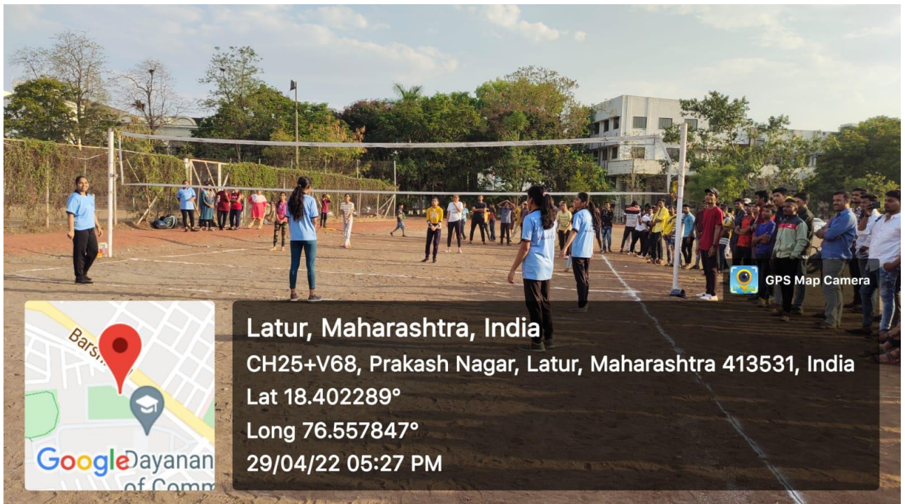
During Volleyball matches of Girls at College ground