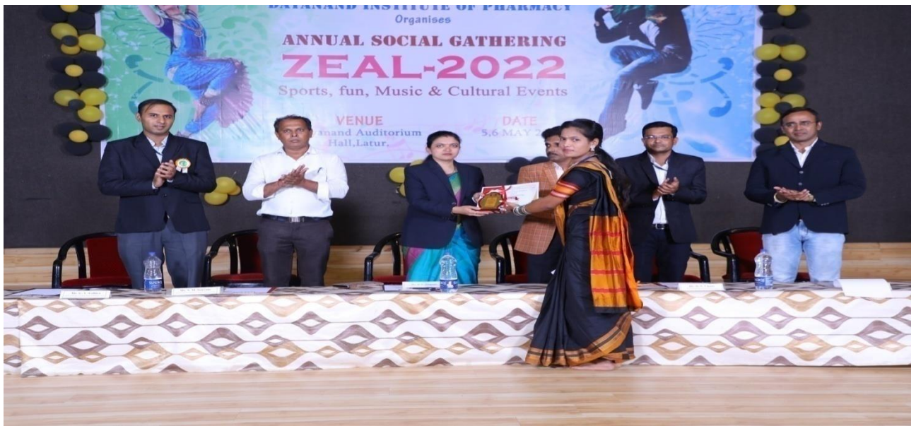
Annual Prize Distribution Ceremony of Gathering ZEAL-2022