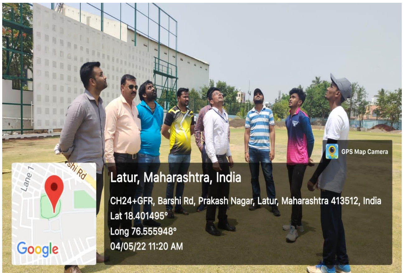
During toss of coin for Boys team Cricket tournament