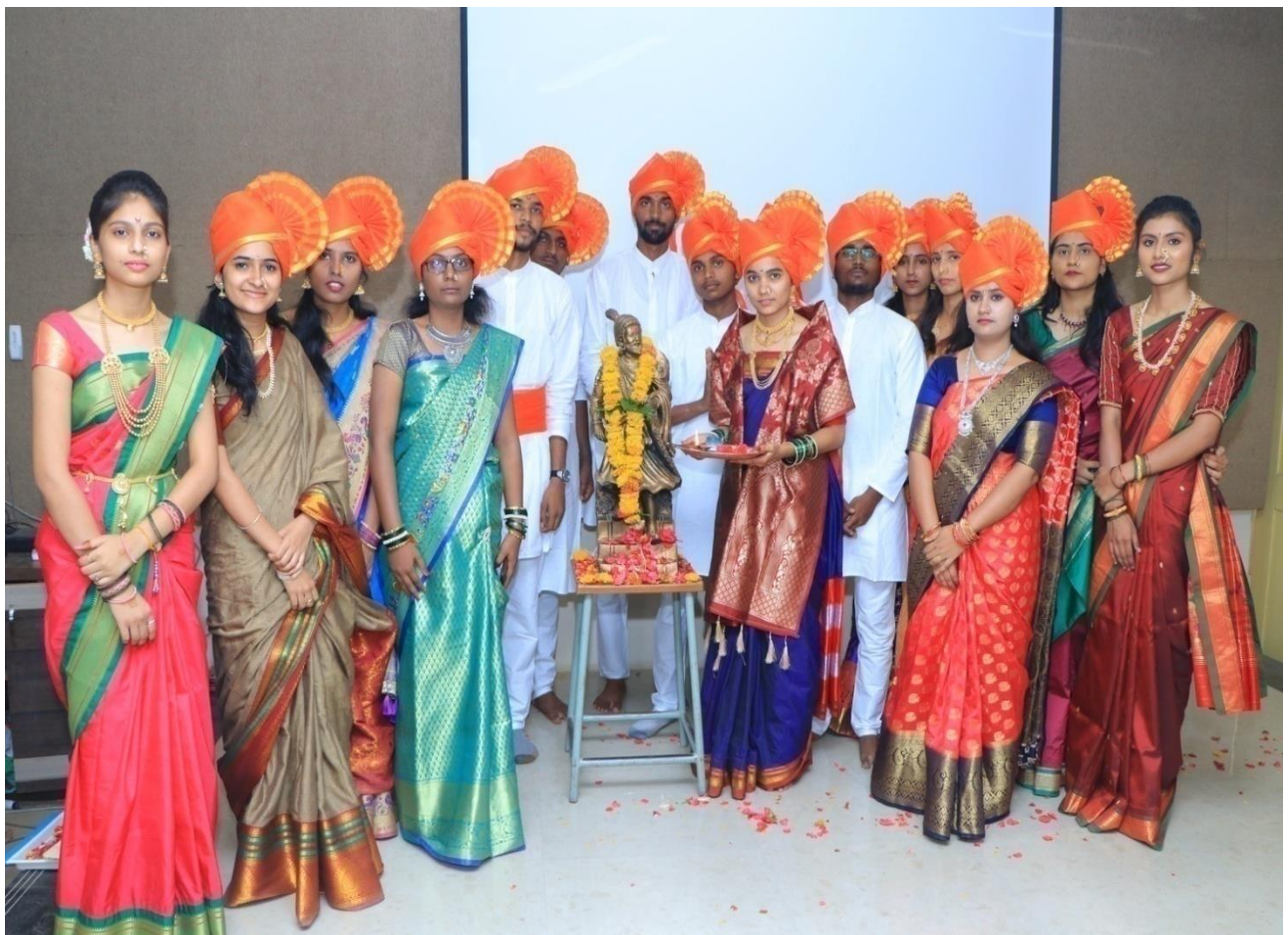
During Cultural Traditional Day event celebration