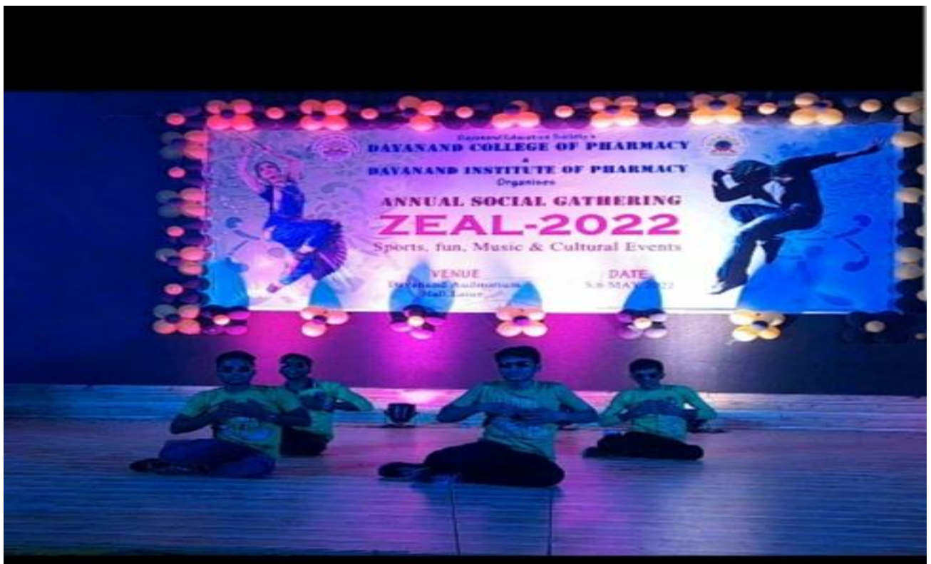
During Cultural event Group Dance competition