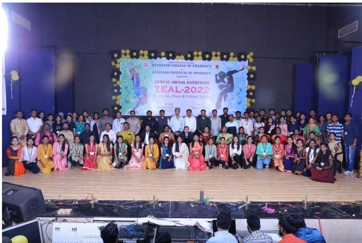
Group photo of B.pharmacy3rd year Students with Teaching Staff