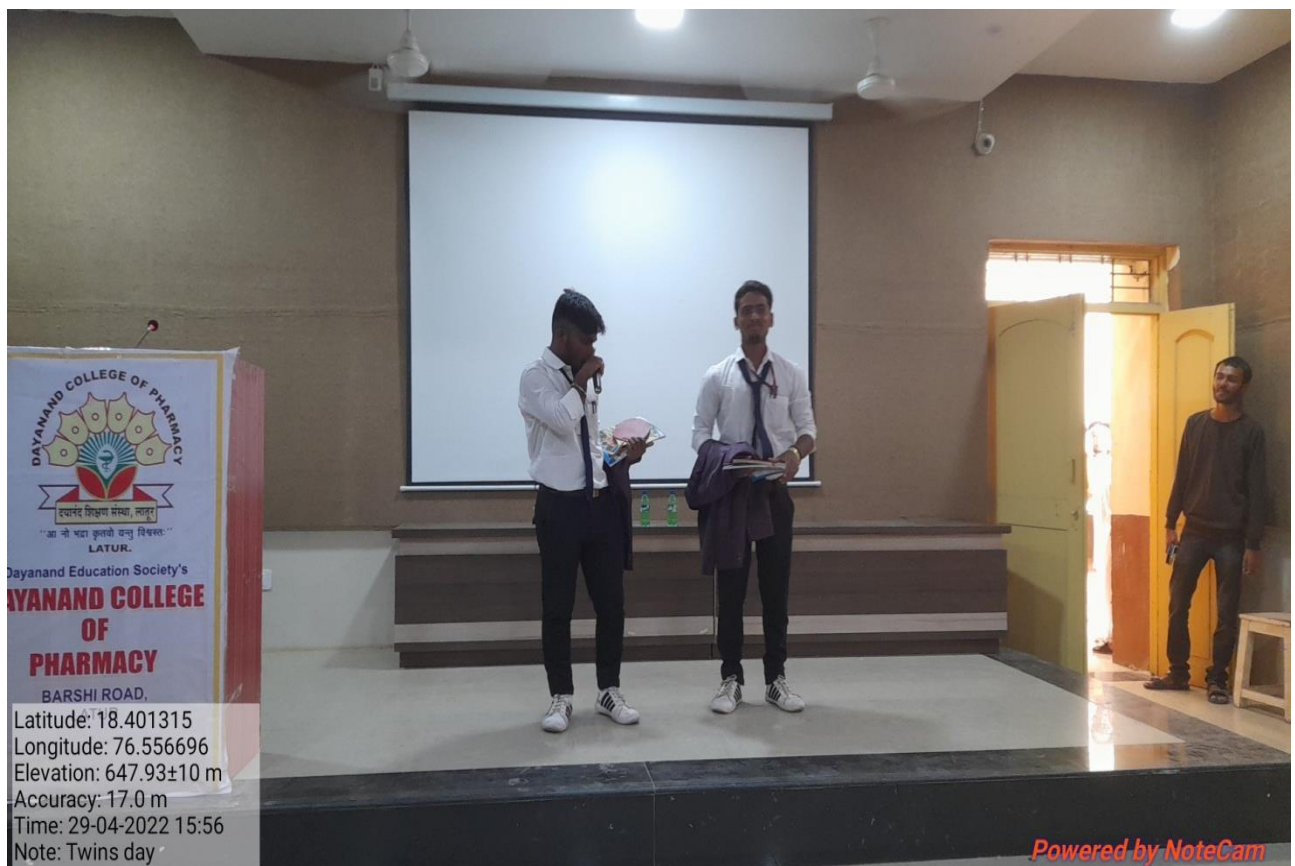
During Cultural events- Twins day competition