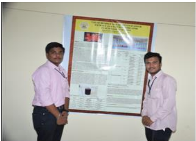
One day workshop on "Skills & Employability development" organised for students of Third and Final year B. Pharm .